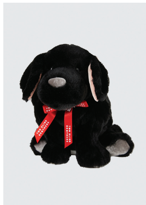
L'Amey America and Two Blind Brothers' “Do Good, Feel Good” partnership was a resounding success.